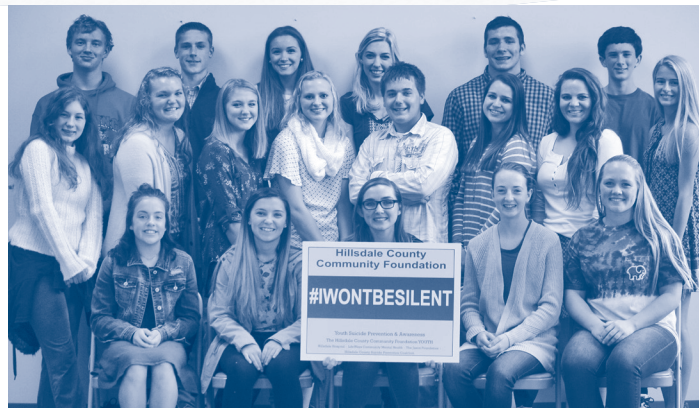
The HCCF YOUTH are proud to be a part of the #iwontbesilent campaign, encouraging young people to talk to someone if they are struggling with anxiety, depression, extreme stress, or bullying.