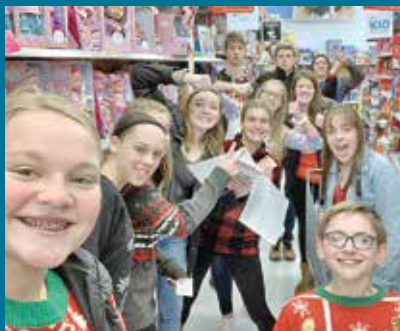
HCCF MEMBERS HAVE A BLAST WHILE SHOPPING IN THEIR CHRISTMAS SWEATERS FOR PRESENTS.

HCCF and the YOUTH were proud to be part of the exciting experience.