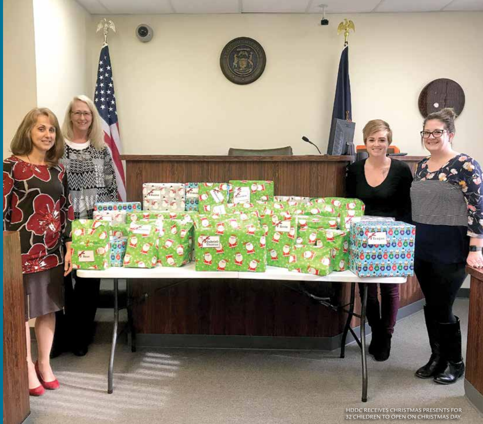
HDDC RECEIVES CHRISTMAS PRESENTS FOR 32 CHILDREN TO OPEN ON CHRISTMAS DAY.