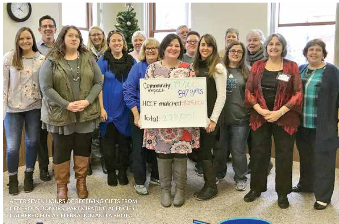
AFTER SEVEN HOURS OF RECEIVING GIFTS FROM GENEROUS DONORS, PARTICIPATING AGENCIES GATHERED FOR A CELEBRATION AND A PHOTO.