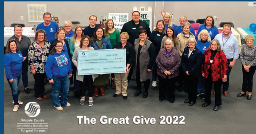
The Great Give 2022